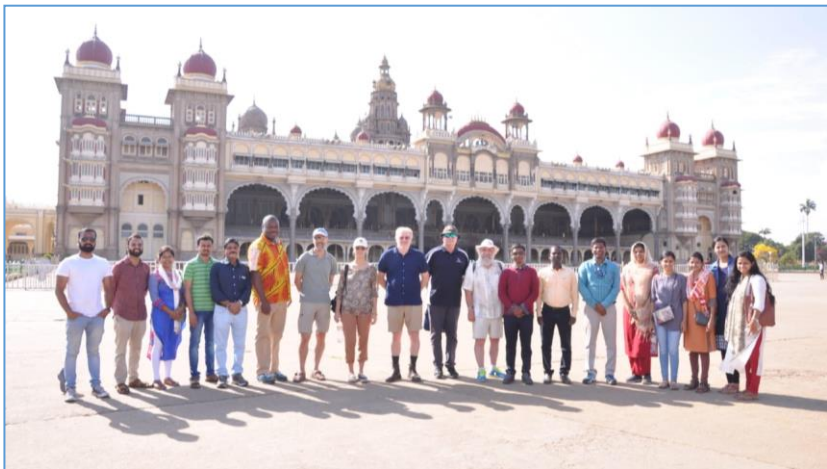
Visit of core Climate Change Session Delegates to Historical Mysore Palace